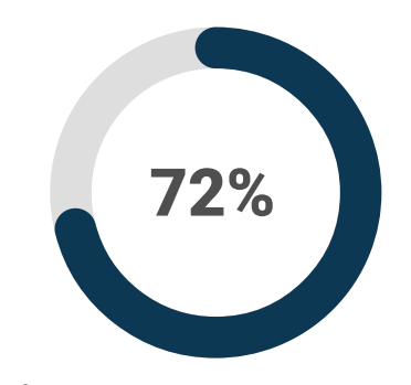
of employees returned to work after visit