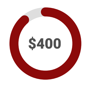
average direct medical cost savings per MedCall telehealth triage call